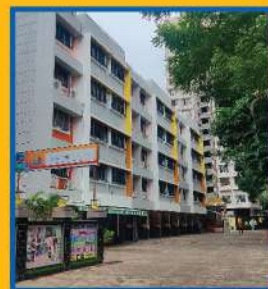
Dr. S. Radhakrishnan International School Borivali (West)