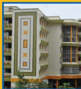
Dr. S. Radhakrishnan International School Malad (West)