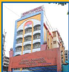
Bombay Cambridge International School Andheri (West)