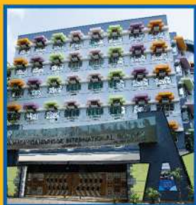
Bombay Cambridge International School Andheri (East)

99201 75276 / 81042 79704 admissions@vbsis.org www.vbsis.org